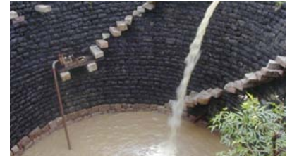
Open well recharge.