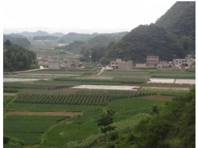
View of the Lucheba watershed, China showing large area under vegetable and cash crops.