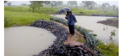
Low-cost water harvesting structure.